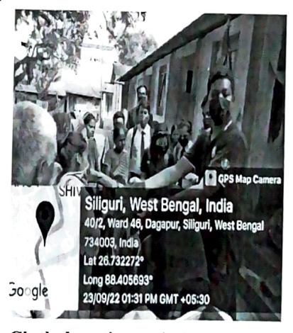
Cloth donation at jeshu ashram