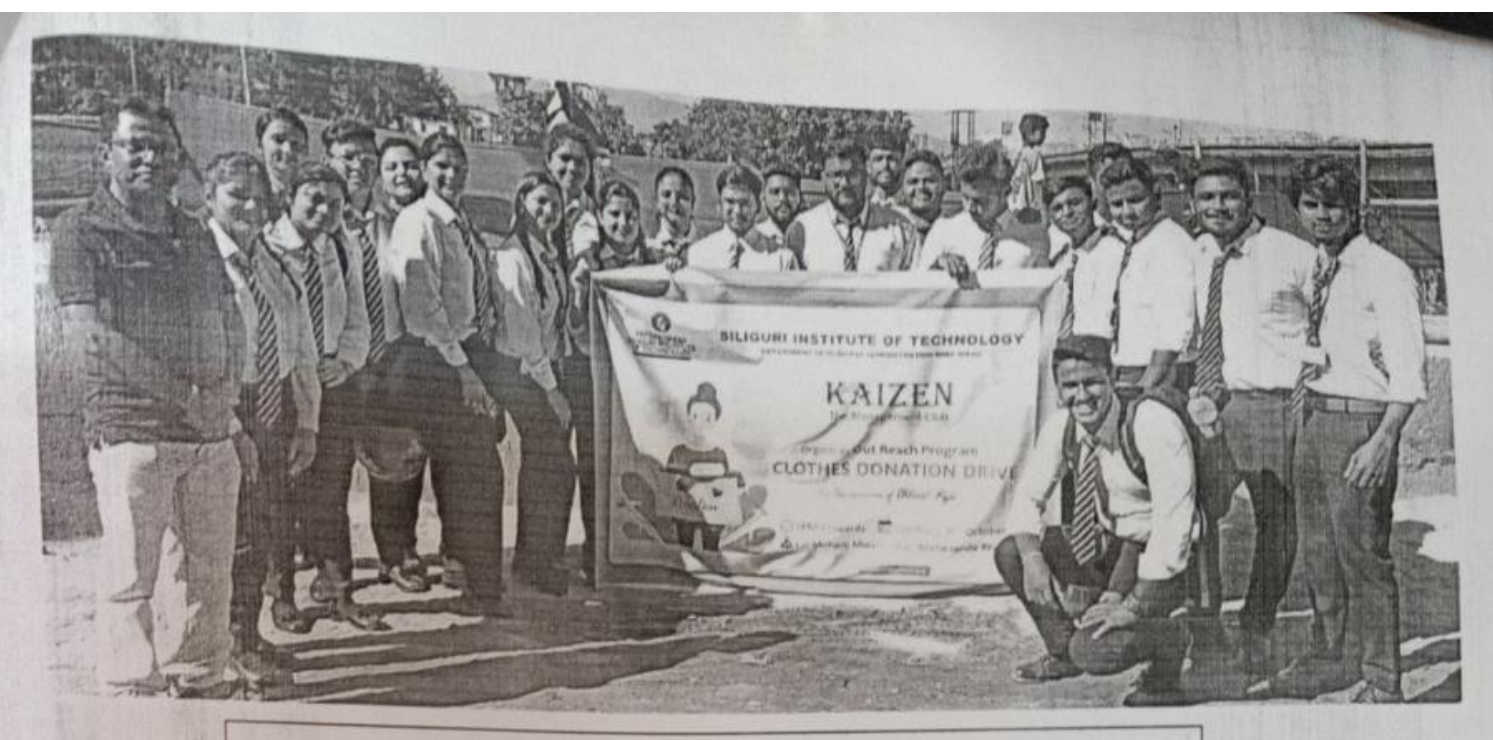
Team "Kaizen" at the venue