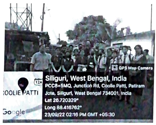
Cloth donation team